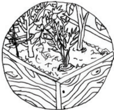
New class harvests the bed in the fall.