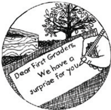
Outgoing class writes letter to incoming class about what they planted.