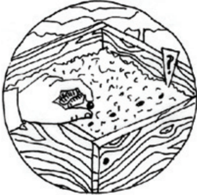
Plant Legacy Gardens bed by June.